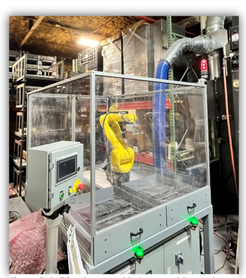
Figure 2. Cell implemented in Perpetual Enterprises shop

Perpetual Enterprises is well positioned should production demand increase further, as automated load/unload of the cell is within reach. Further, the relationship developed with Premier Automation has facilitated exploration of other tasks ripe for automation.